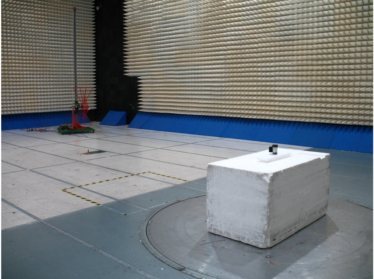
Radiated Emissions, 30MHz-1GHz