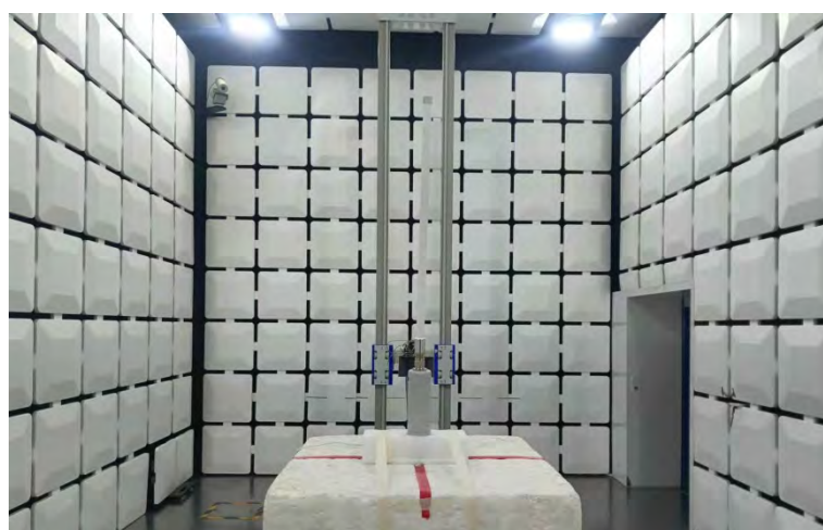
1GHz ~ 10GHz