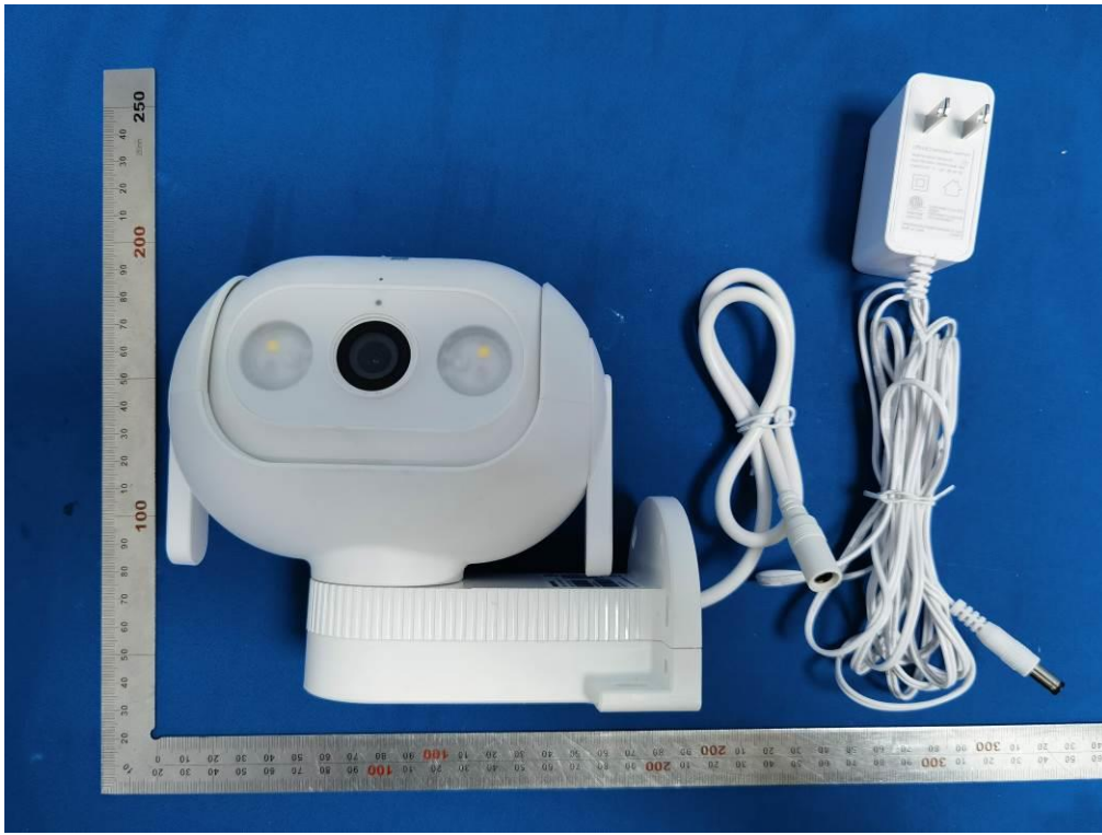
VIEW OF ADAPTER