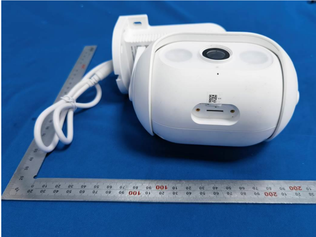
BACK VIEW OF EUT