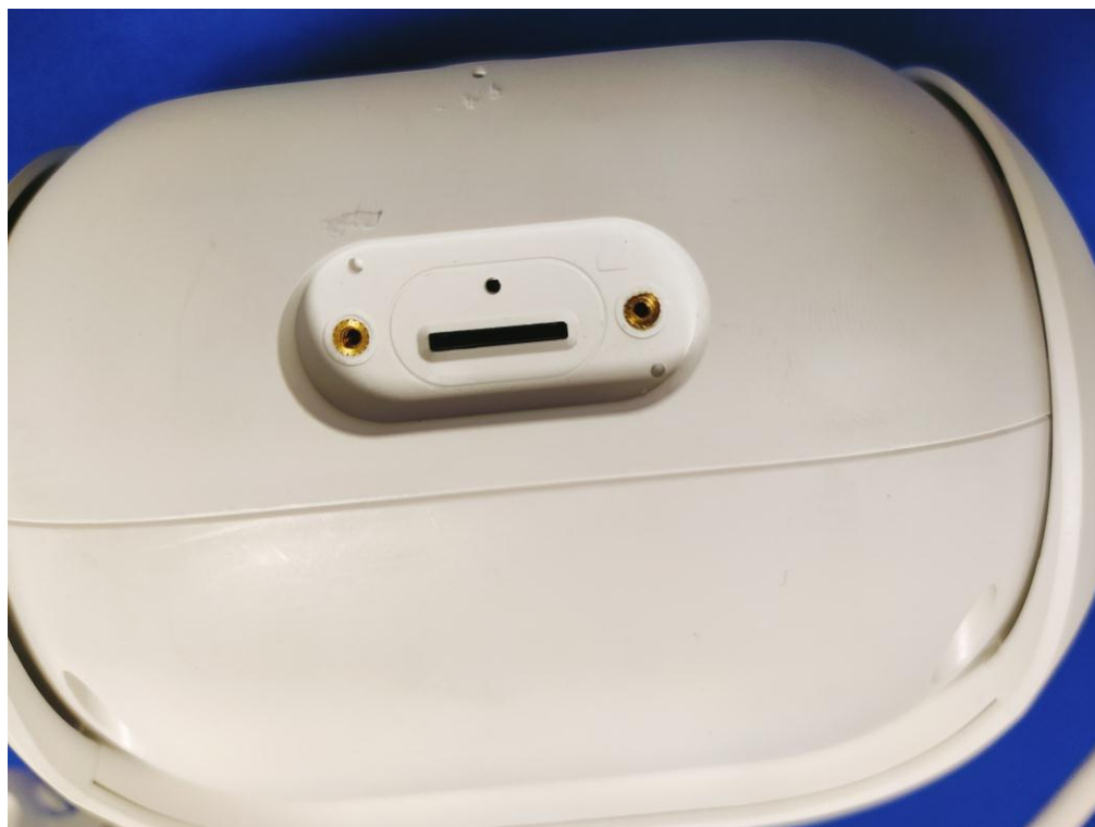
ADAPTER CLOSE-UP PHOTO-1