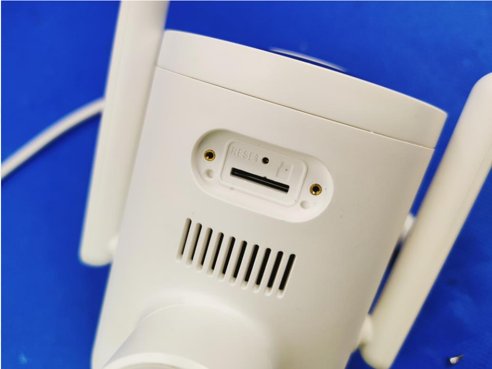
ADAPTER VIEW OF EUT