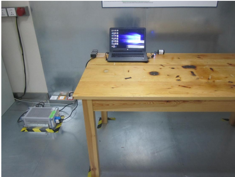
DSS radiation L