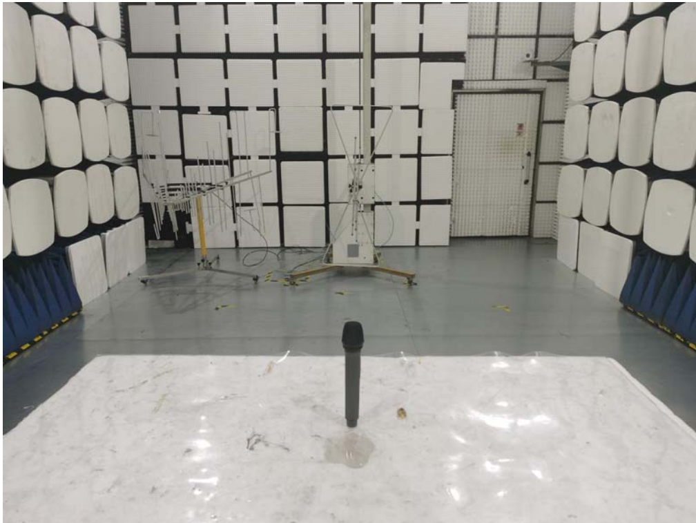
Below 1 GHz