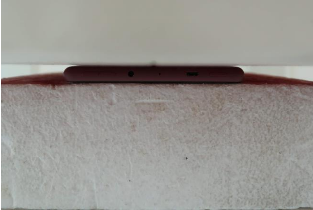
Bottom Face at 0 mm