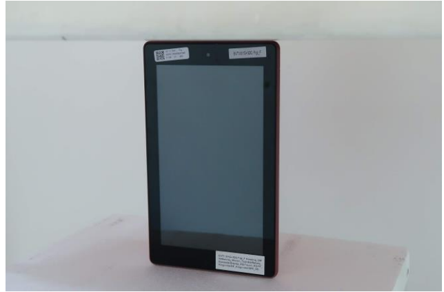
Edge1 at 0 mm