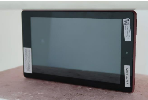
Edge4 at 0 mm