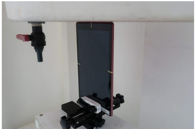
Edge3, Test Separation 0 mm