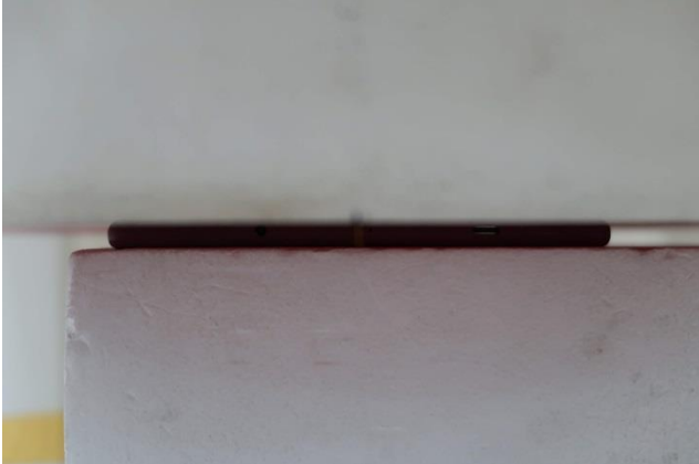
Bottom Face, Test Separation 0 mm