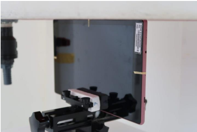
Edge4, Test Separation 0 mm