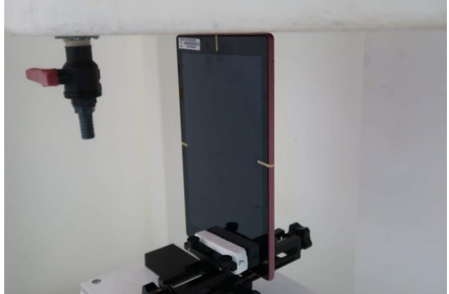
Edge1, Test Separation 0 mm