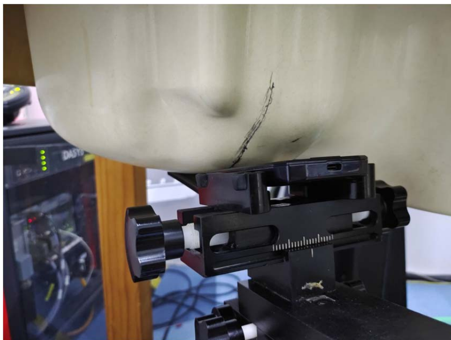
Head Right TiltSetup Photo (0mm)