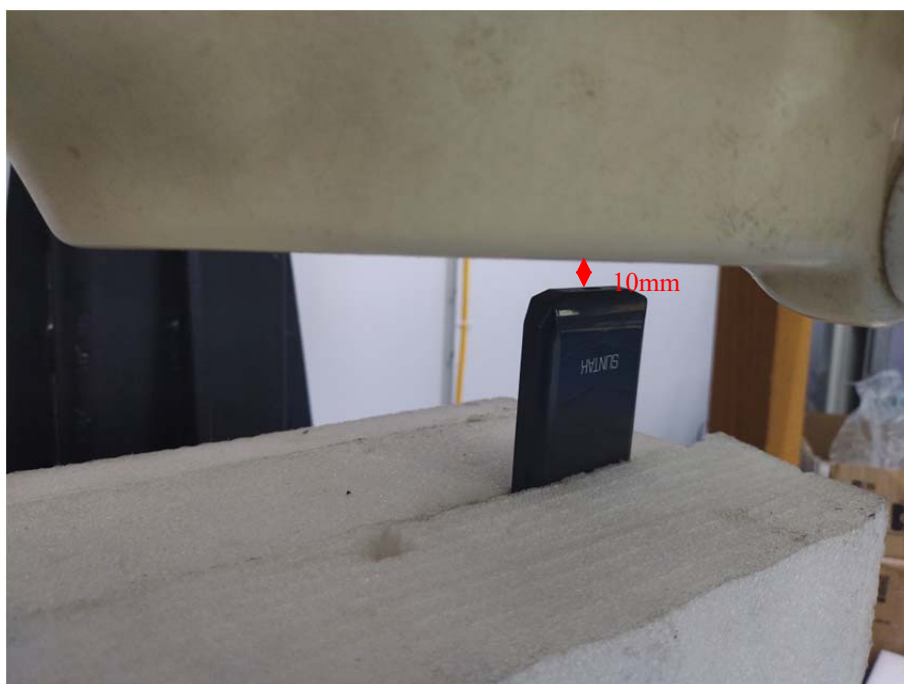
Body Top Setup Photo(10mm)