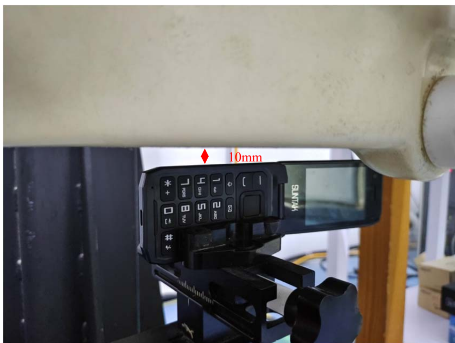
Body Right Setup Photo(10mm)