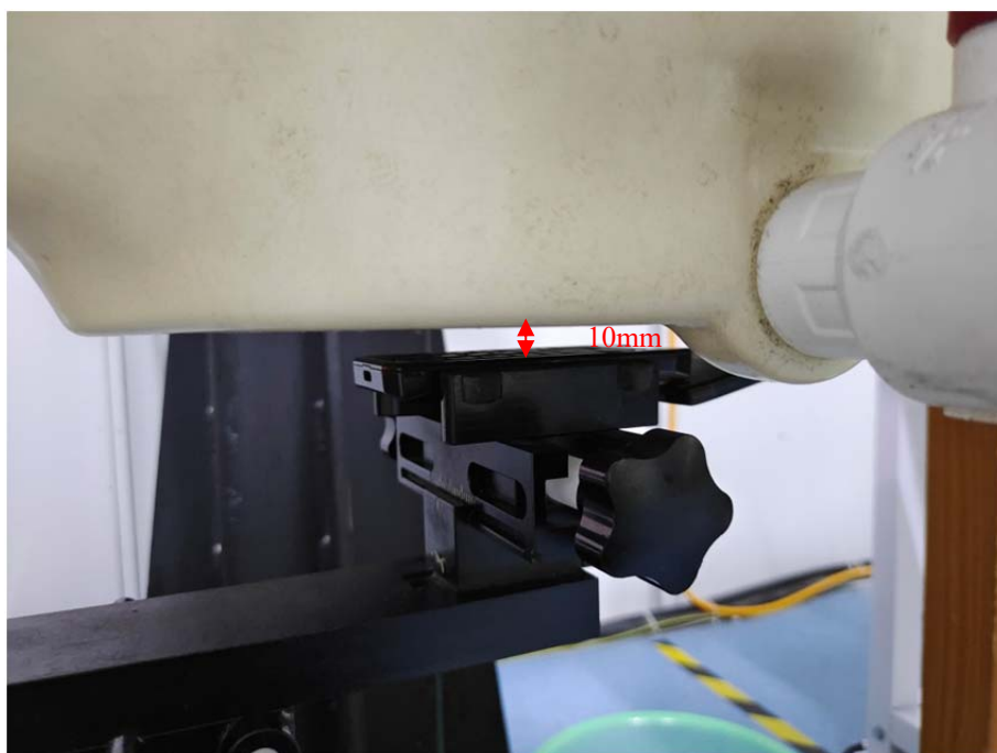
Body(Wron) Back Setup Photo(10mm)