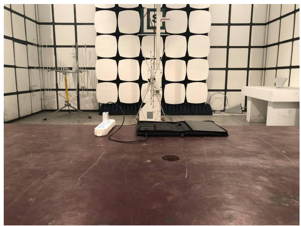
Radiated Emission below 1GHz-AC adapter charge mode