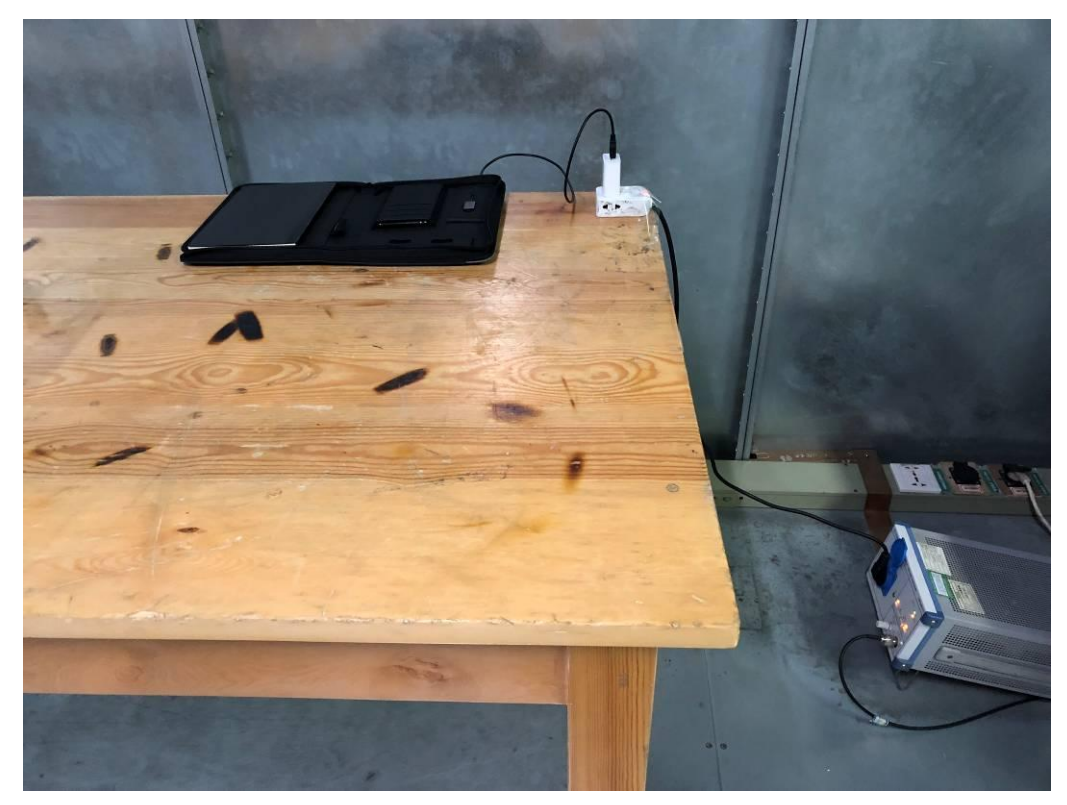
Conducted Emission-AC adapter charge mode