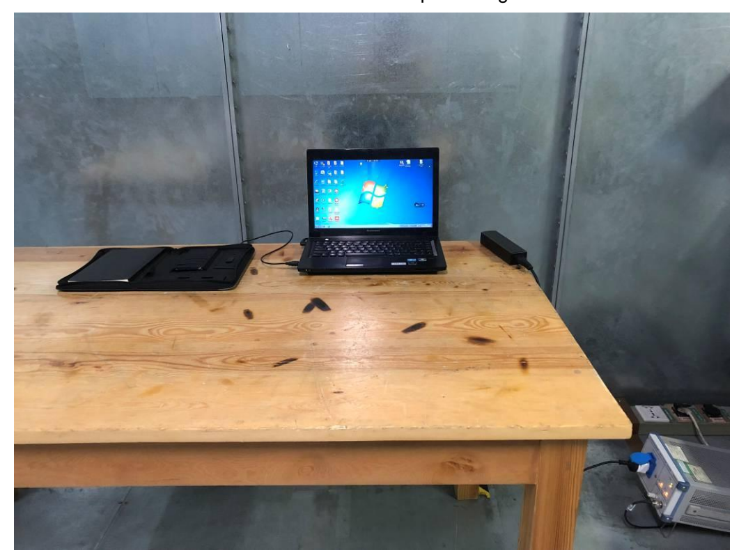
Conducted Emission-PC charge mode