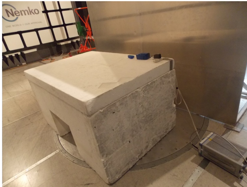
AC power line conducted emissions setup photo