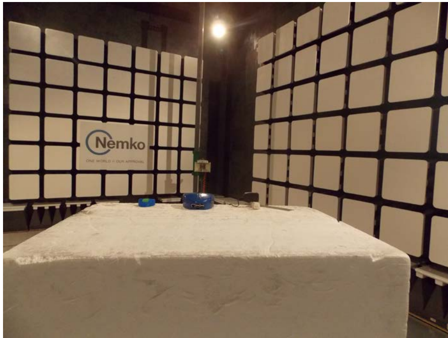
Radiated spurious (out-of-band) emissions setup photo – above 1 GHz