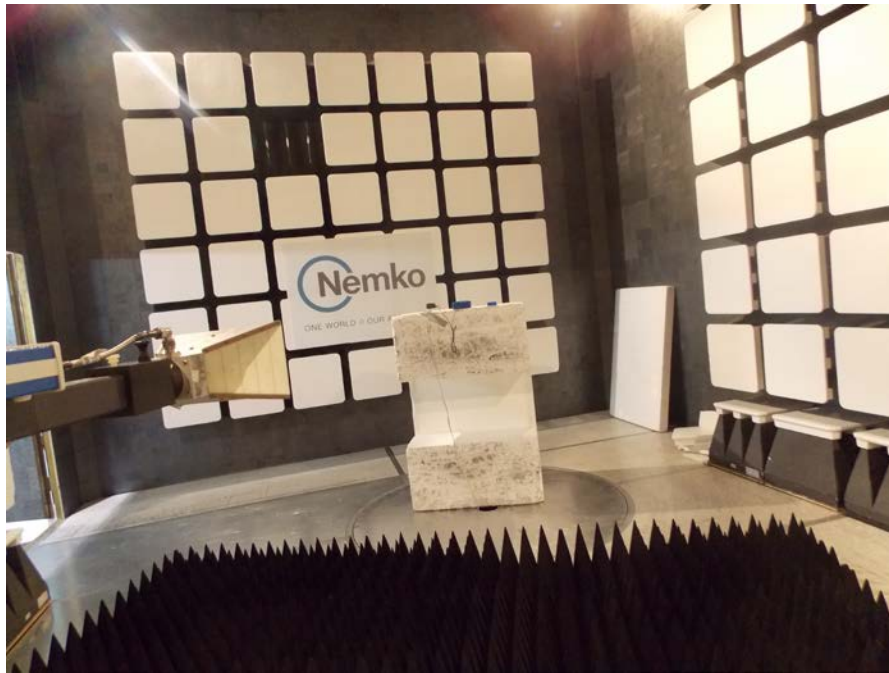
Radiated spurious (out-of-band) emissions setup photo – above 1 GHz