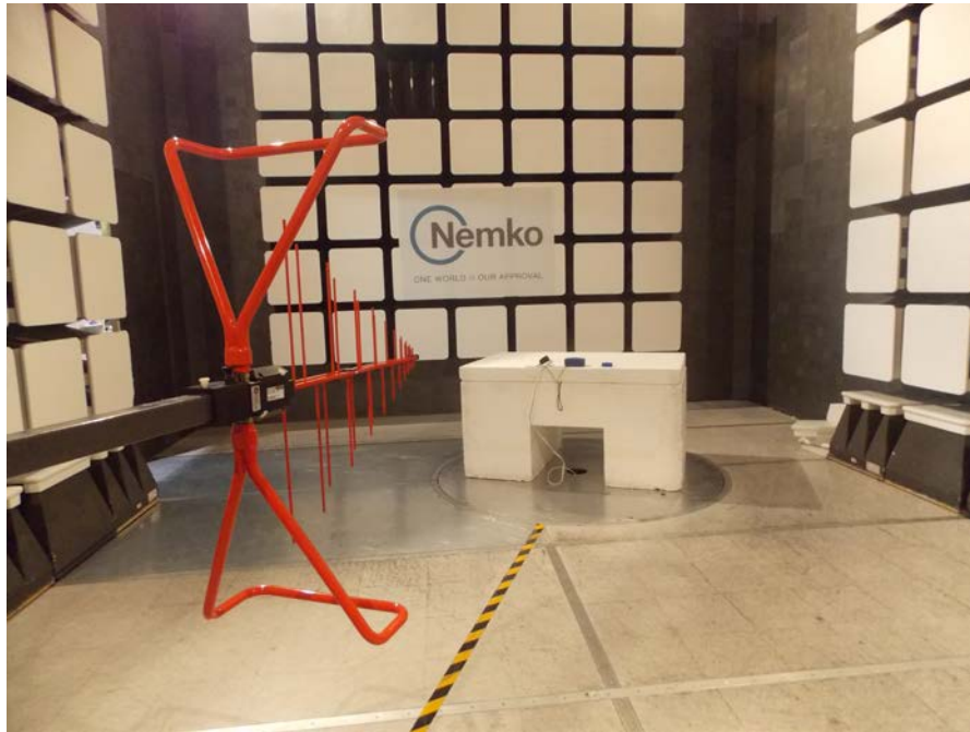
Radiated spurious (out-of-band) emissions setup photo – 30 to 1000 MHz