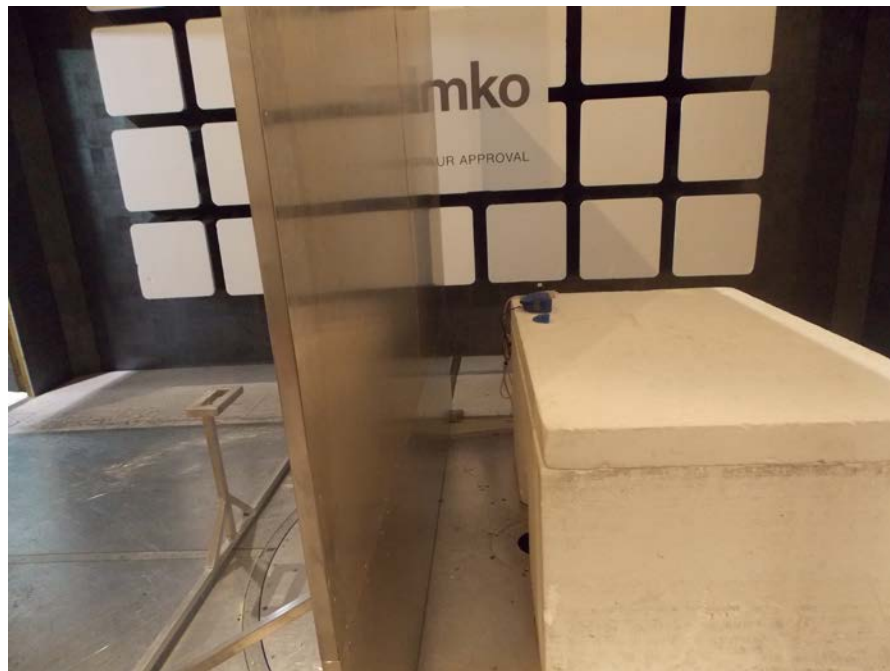
AC power line conducted emissions setup photo