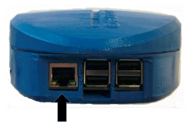
10/100BaseT Ethernet Port

Figure 1-4 TOF RTLS Reader connection ports.