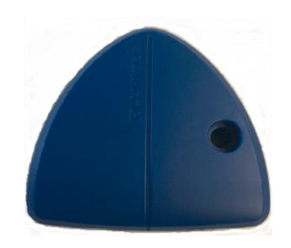
Figure 1-2 TOF RTLS Asset Tag

The TOF RTLS reader is equipped with four status indicators on the top of the enclosure. These LEDs provide indication of the following: