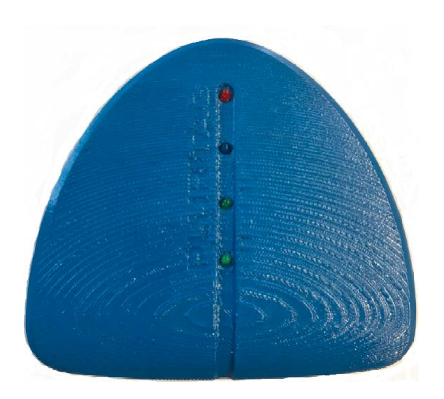
Figure 1-1 TOF RTLS Reader

PLURITAG'S TOF technology is a RTLS system based on Decawave's DWM1001 module. This module uses a Decawave's DW1000 UWB transceiver IC compliant with IEEE-802.15.4-2011. The purpose of the technology is to do indoor localization using readers and tags deployed at a customer's site. The readers are installed at known positions and tags are used on items that needs to be localized inside plants or buildings.