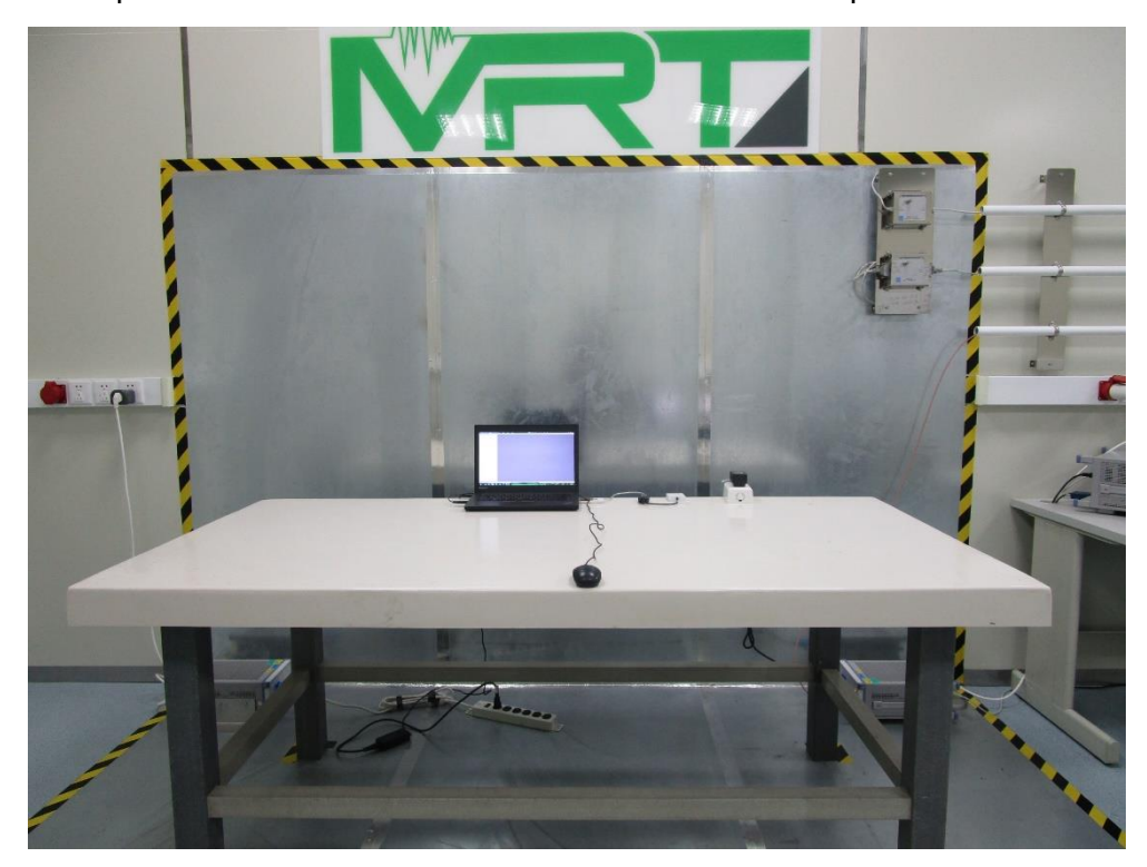
Description: Back View of Conducted Emission Test Setup

Description: Front View of Conducted Emission Test Setup