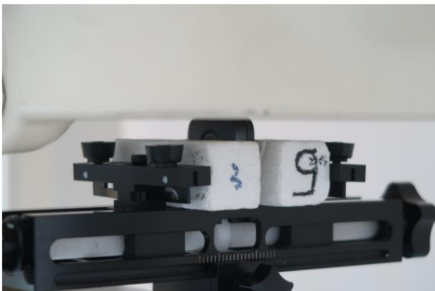
Top Side at 0 mm