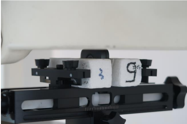
Top Side at 0 mm