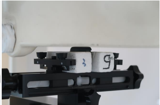
Left Side at 0 mm