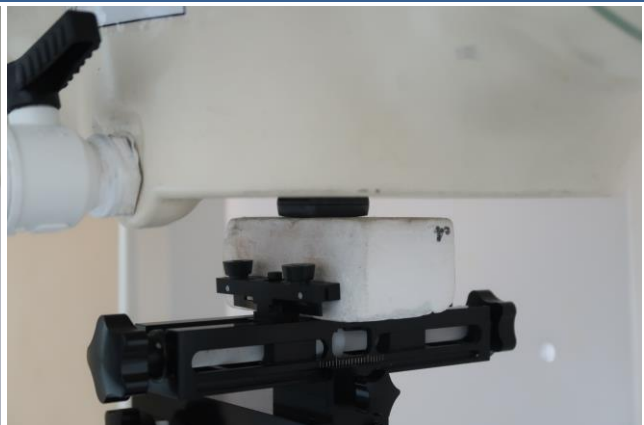
Back at 0 mm