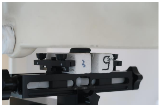
Left Side at 0 mm