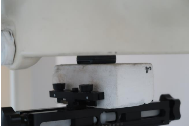
Front at 0 mm