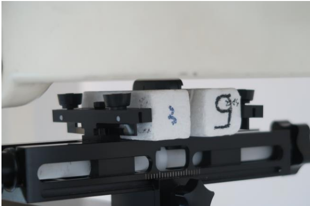
Right Side at 0 mm