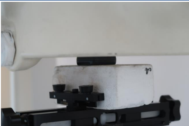
Front at 0 mm