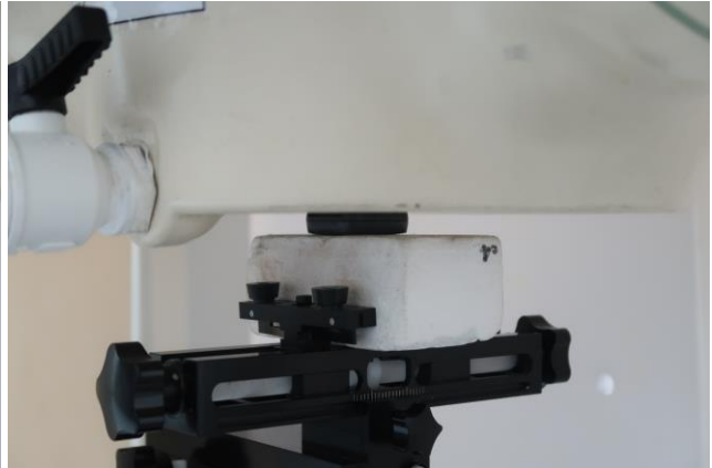
Back at 0 mm