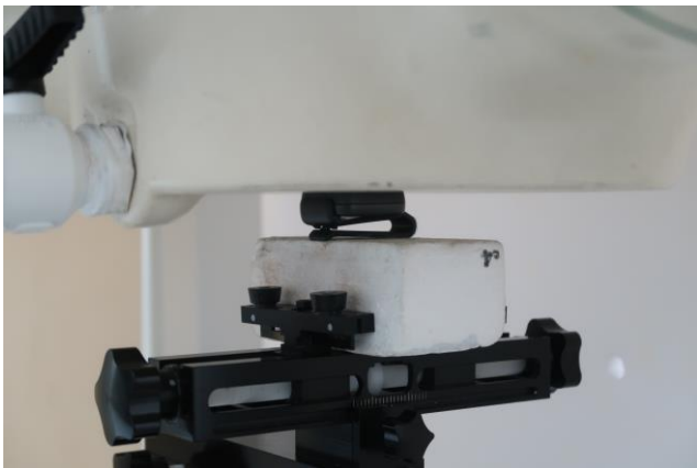
Front with Clip at 0 mm