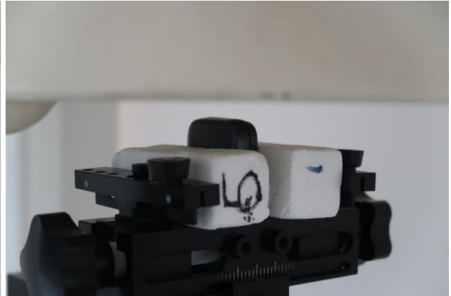
Bottom Side at 10 mm