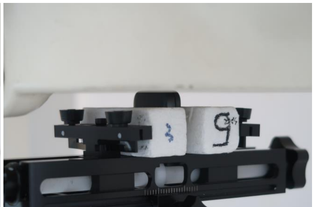
Bottom Side at 0 mm