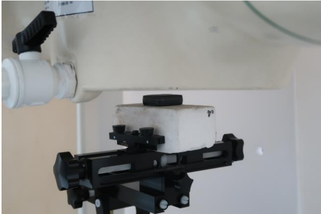
Front at 10 mm