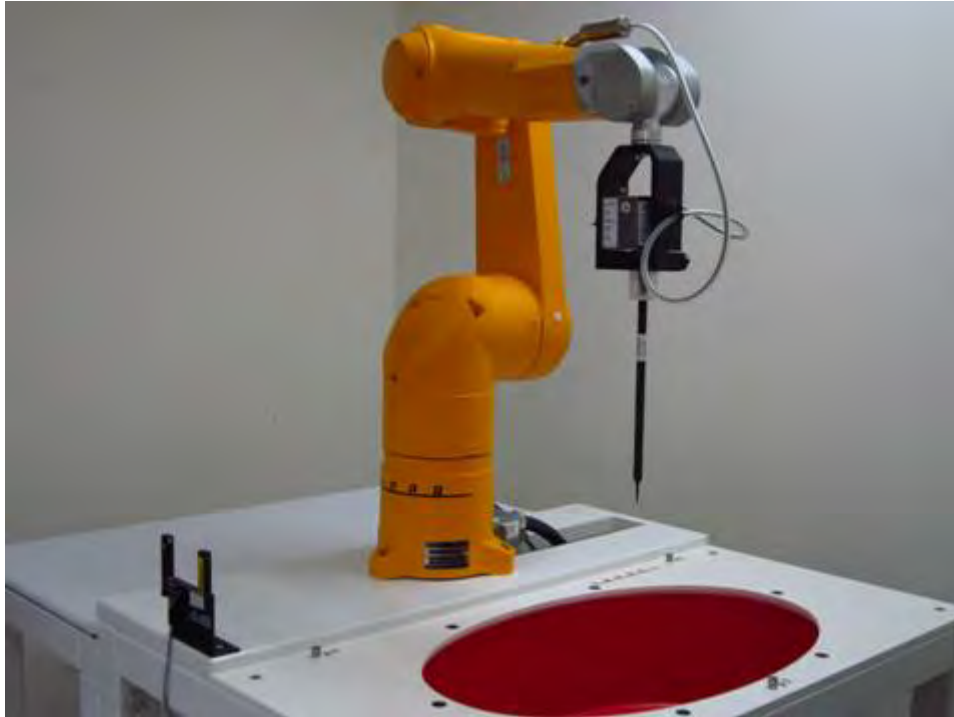
Fig.1 Photograph of the SAR measurement system

Unless otherwise stated the results shown in this test report refer only to the sample(s) tested and such sample(s) are retained for 90 days only. 除非另有說明，此報告結果僅對測試之樣品負責，同時此樣品僅保留90天。本報告未經本公司書面許可，不可部份複製。