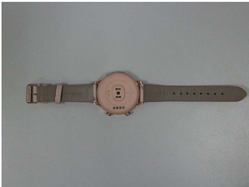
Fig.5 Back view of EUT

Unless otherwise stated the results shown in this test report refer only to the sample(s) tested and such sample(s) are retained for 90 days only. 除非另有說明，此報告結果僅對測試之樣品負責，同時此樣品僅保留90天。本報告未經本公司書面許可，不可部份複製。