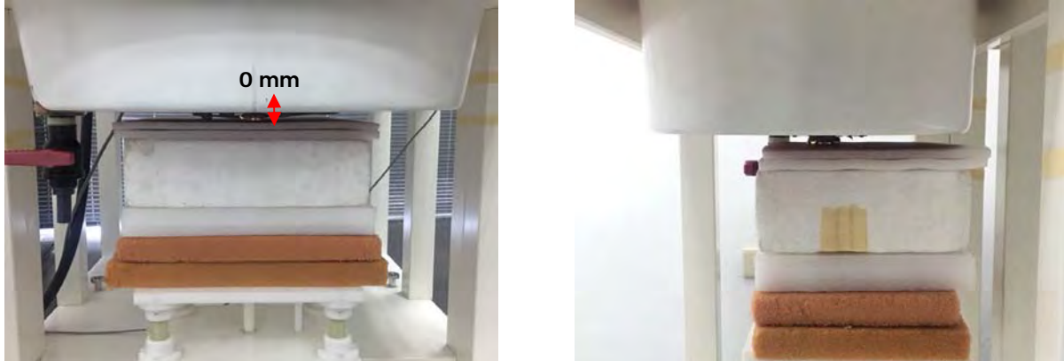
Fig.3 EUT Back side to flat phantom

Unless otherwise stated the results shown in this test report refer only to the sample(s) tested and such sample(s) are retained for 90 days only.