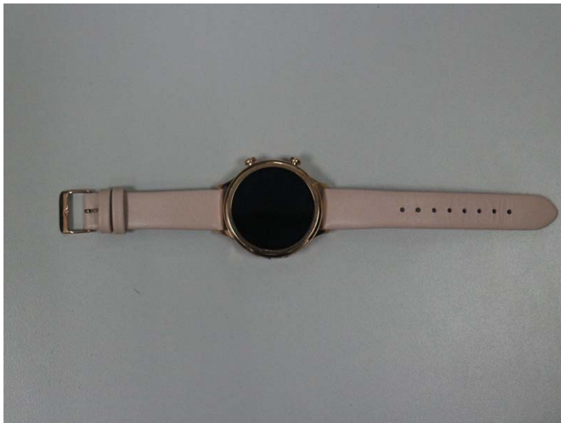
Fig.4 Front view of EUT