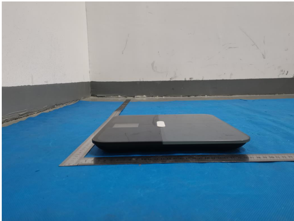
PORT VIEW OF EUT