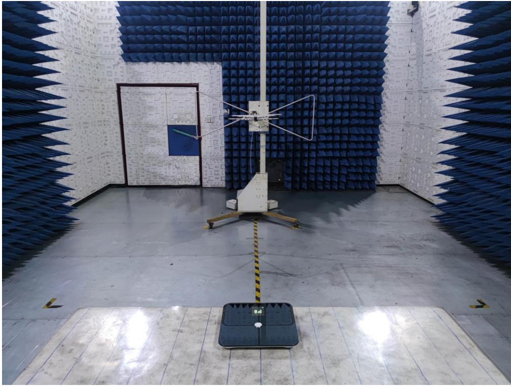
RADIATED EMISSION TEST SETUP ABOVE 1GHz