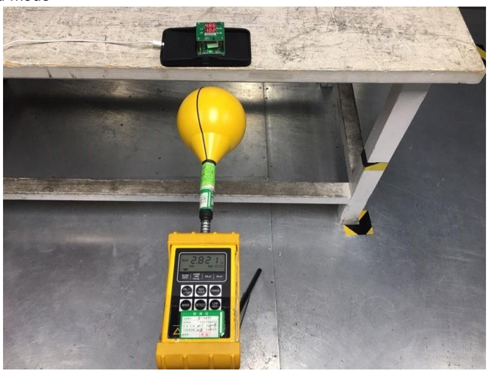
For No load mode