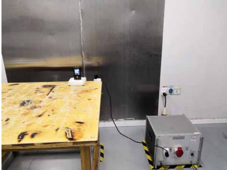
Test Site 1#