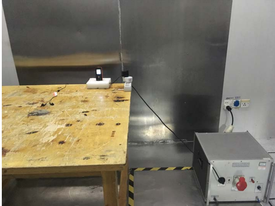
Test Site 1#