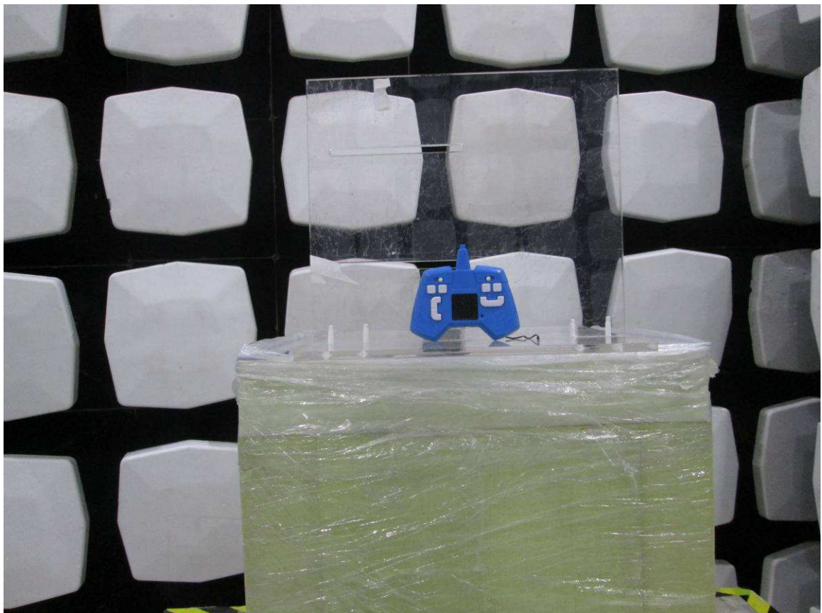
Above 1GHz (The EUT placed at the center of the turntable)