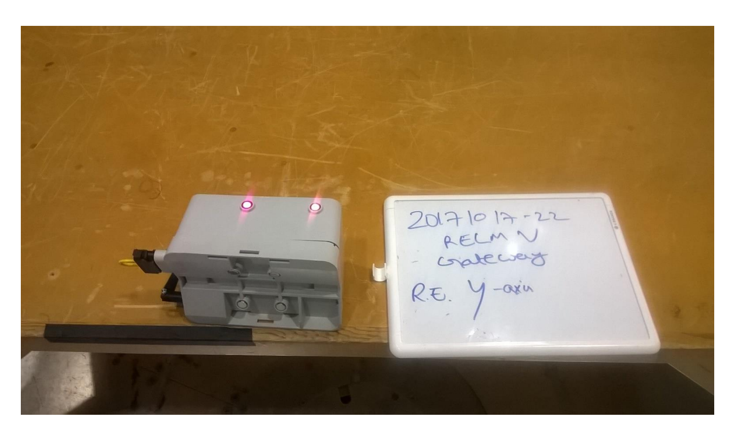
Figure 2 - Y-axis