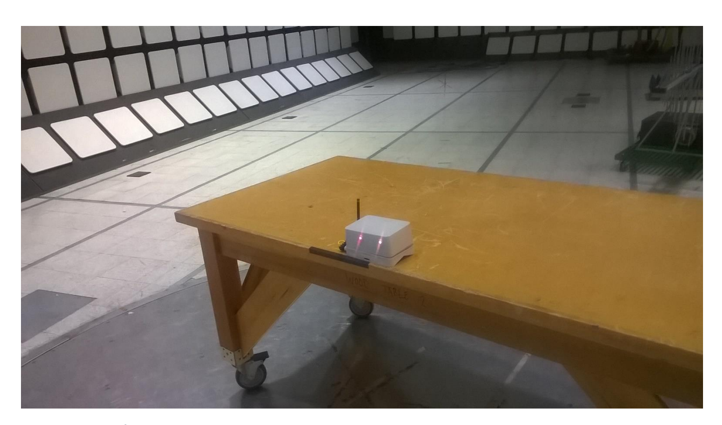
Figure 4 - Test setup for 30MHz - 1GHz