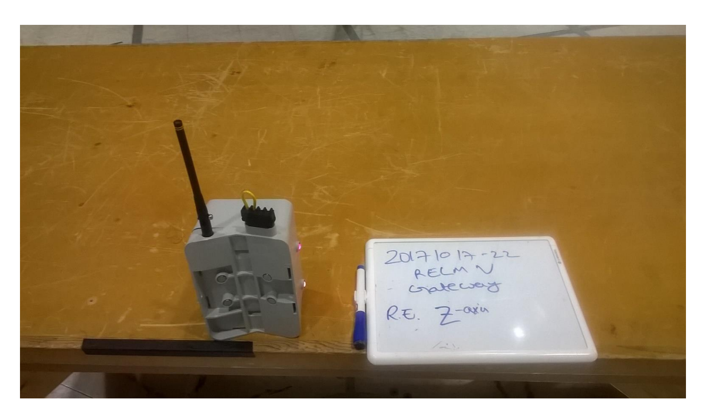
Figure 3 - Z-axis