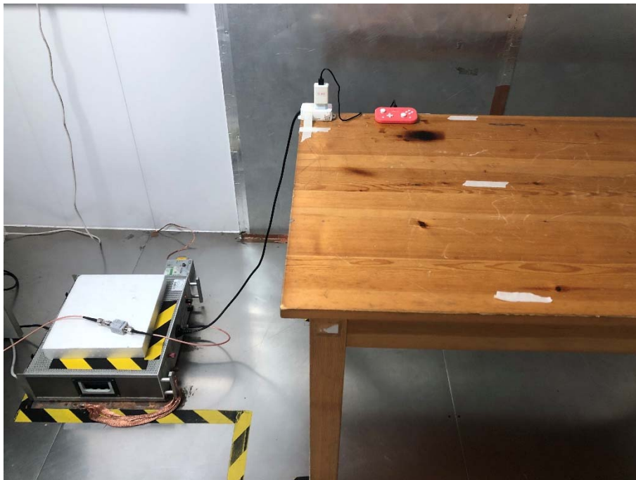
Test Photo 1