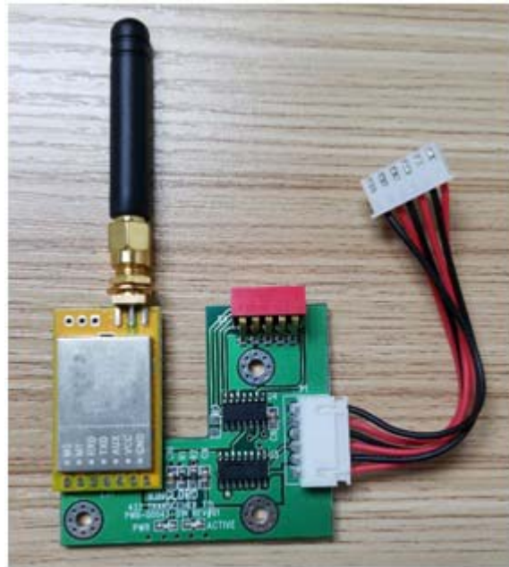
Figure 1. KTX433-UART Wireless Module