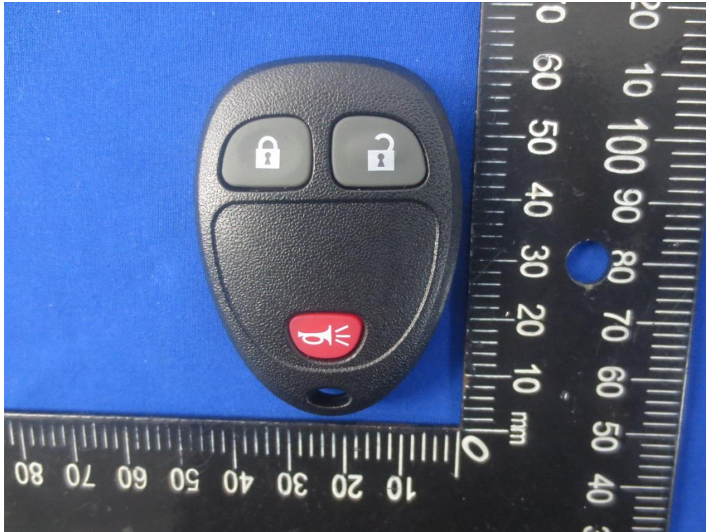
External Photos 3B