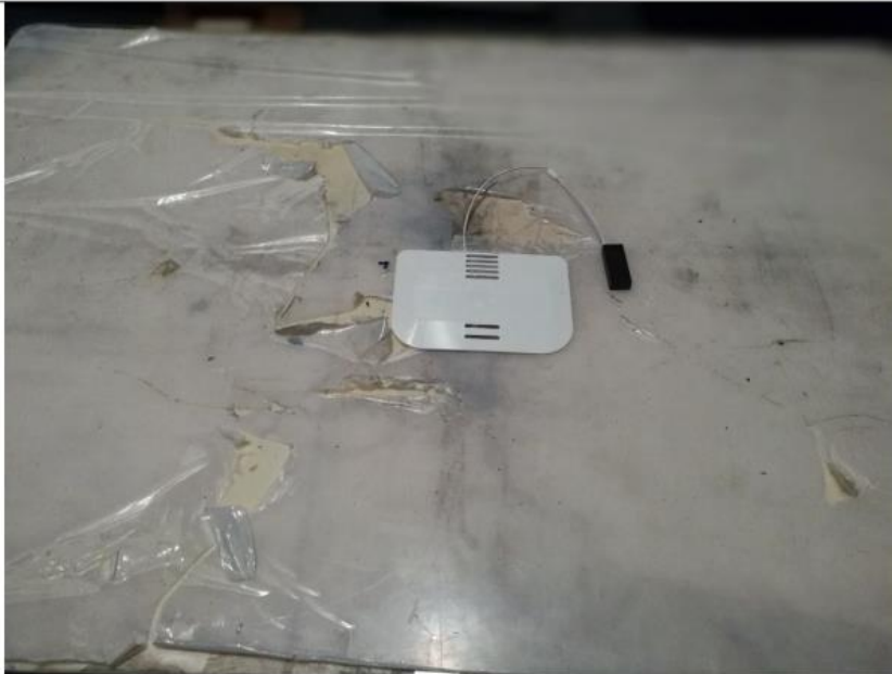
Photograph for Unwanted Emission in restricted frequency bands