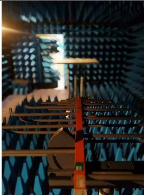
Photograph for Unwanted Emission in restricted frequency bands