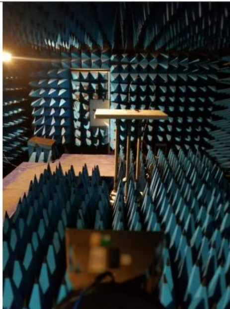
Photograph for Unwanted Emission in restricted frequency bands