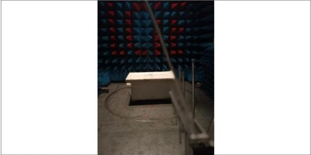
Photograph for Unwanted Emission in restricted frequency bands