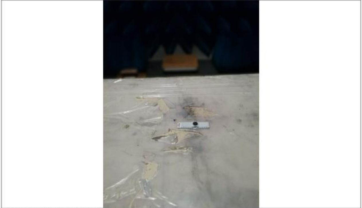
Photograph for Unwanted Emission in restricted frequency bands