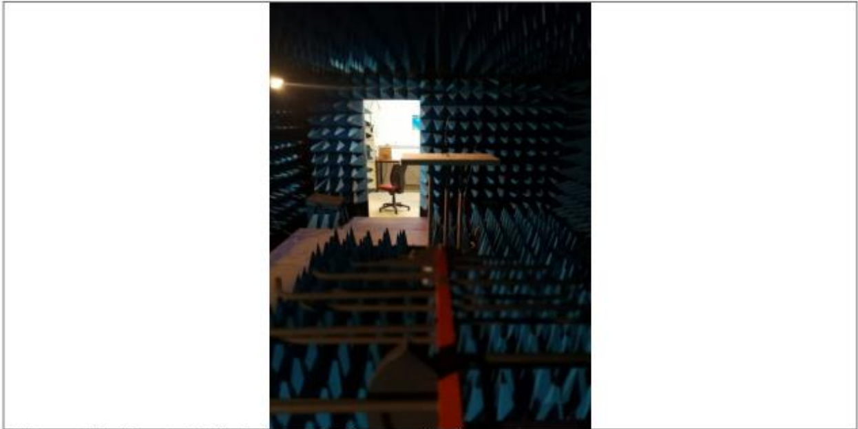
Photograph for Unwanted Emission in restricted frequency bands

LCIE SUD EST Laboratoire de Moirans Z.I. Centr'Alp 170, Rue de Chatagnon 38430 MOIRANS - FRANCE