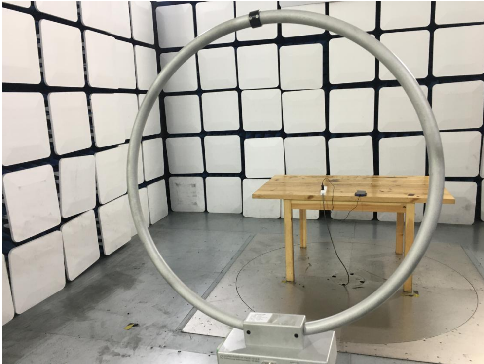
Photo of MPE Measurement