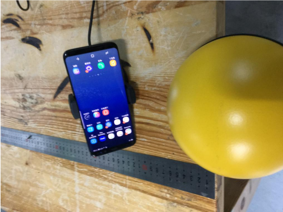
Photo of MPE Measurement