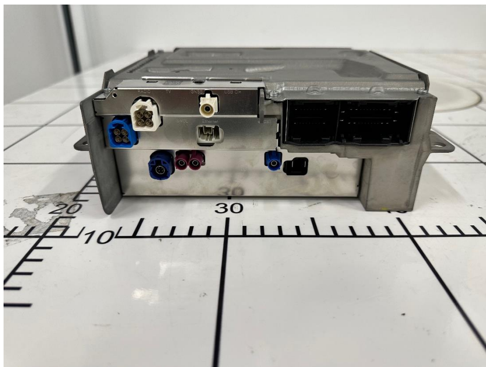
Figure C2. Rear view of the DUT