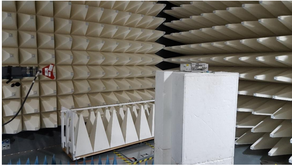
Figure C5. Radiated Emission High Range 18-40GHz test setup