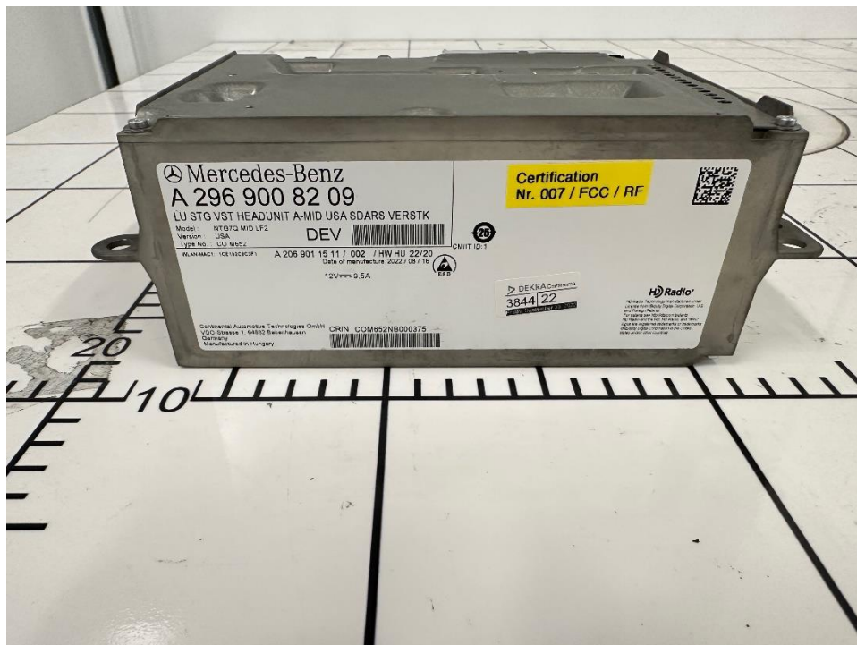
Figure C1. Front/Top view of the DUT