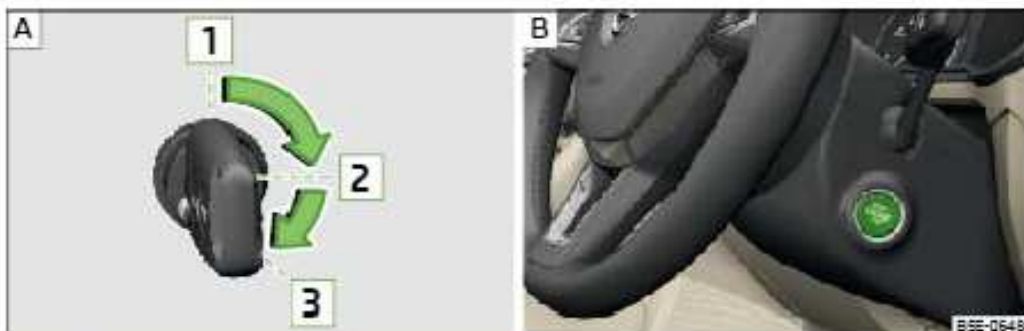
Fig. 172 Positions of the vehicle key in the ignition lock / starter button

Read and observe I and J on page 135 first.