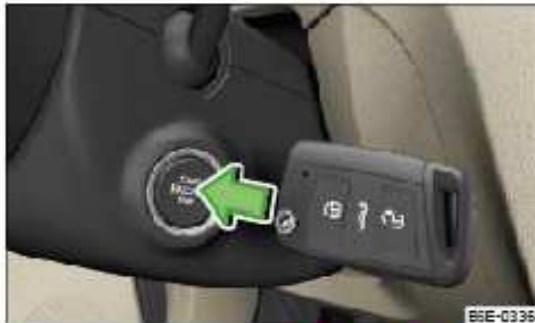
Fig. 173 Starting the engine - press the button with the key

Read and observe ! and ! on page 135 first.