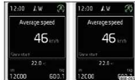
Fig. 174 Display