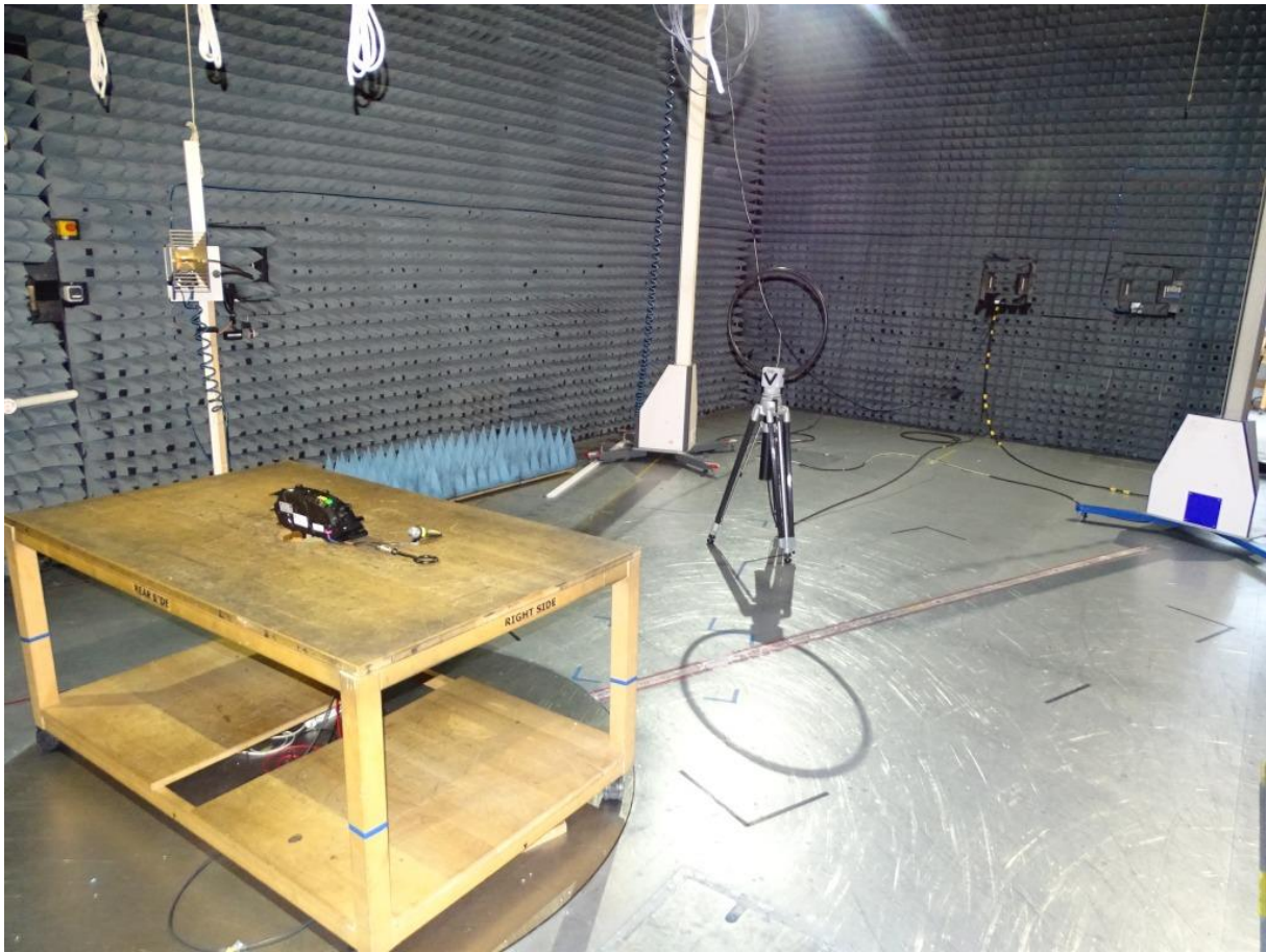
Photo 1: Test setup for radiated measurements (Enclosure, below 30 MHz, intentional radiator §15.209, ANSI C63.10)