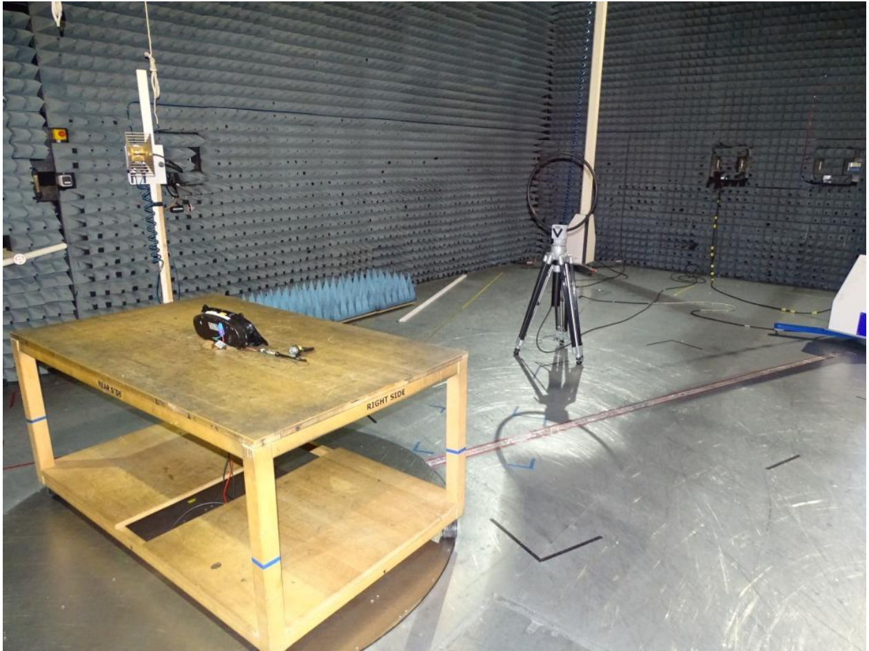
Photo 1: Test setup for radiated measurements (Enclosure, below 30 MHz, intentional radiator §15.209, ANSI C63.10)