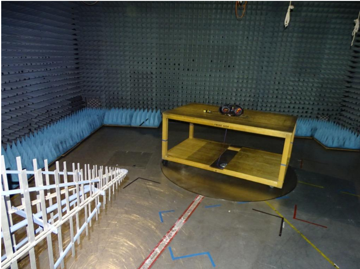
Photo 2: Test setup for radiated measurements (Enclosure, semi-anechoic chamber, 30 MHz to 1 GHz, intentional radiator §15.209, ANSI C63.10)