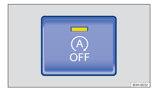
Fig. 133 In the lower part of the centre console: button for the start/stop system.

The start/stop system automatically switches the engine off when the vehicle is coming to a stop and when stationary. When required, the engine restarts automatically.