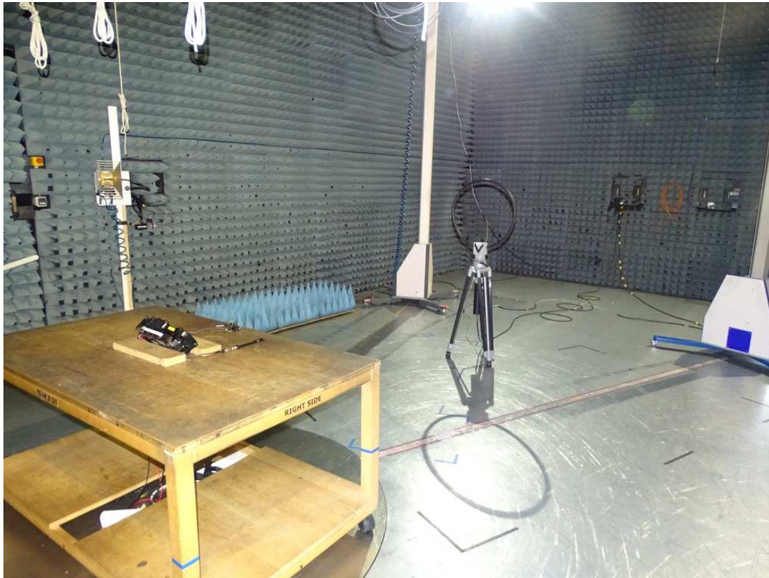
Photo 1: Test setup for radiated measurements (Enclosure, below 30 MHz, intentional radiator §15.209, ANSI C63.10)