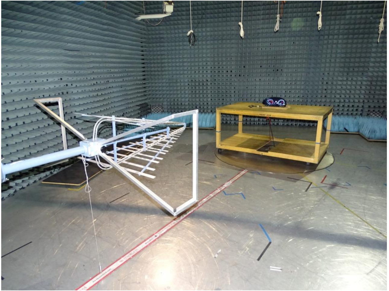
Photo 2: Test setup for radiated measurements (Enclosure, semi-anechoic chamber, 30 MHz to 1 GHz, intentional radiator §15.209, ANSI C63.10)