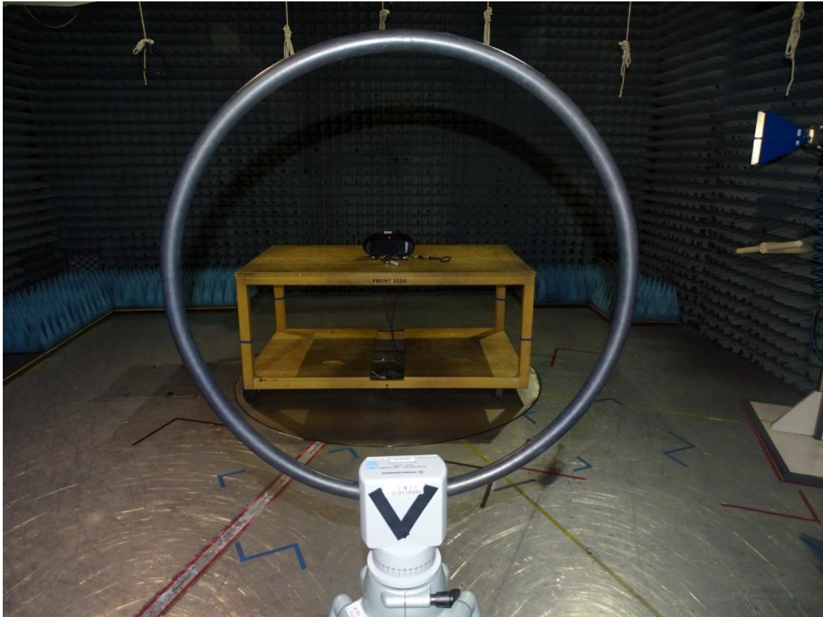
Photo 1: Test setup for radiated measurements (Enclosure, below 30 MHz, intentional radiator §15.209, ANSI C63.10)