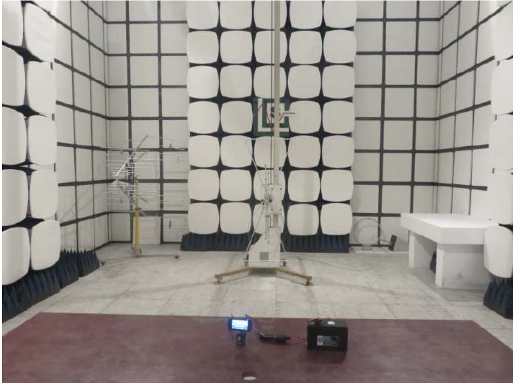
Radiated Emission below 1GHz