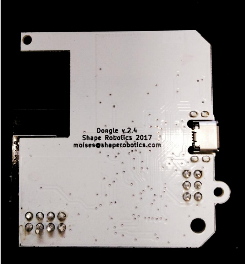
Figure 2- Dongle PCB Bottom