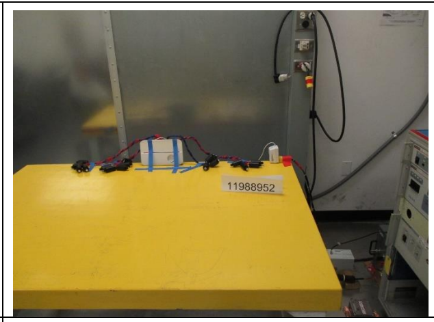
LINE CONDUCTED FRONT PHOTO