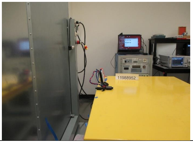
LINE CONDUCTED FRONT PHOTO