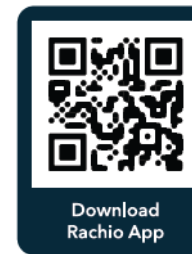
Download Rachio App