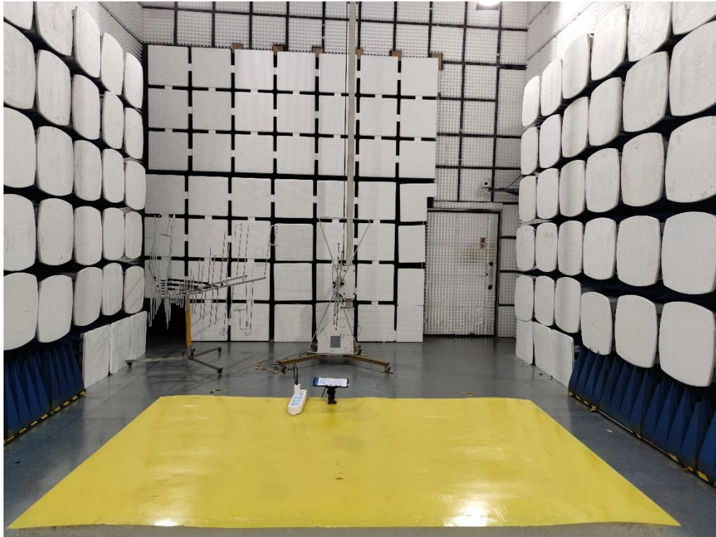
Radiated Emission below 1GHz-AC adapter charge mode