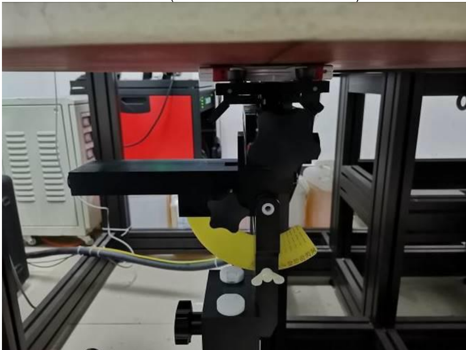
Front Side (distance 0mm with Flat Phantom)