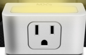
WiFi Smart Socket with Night Lighting