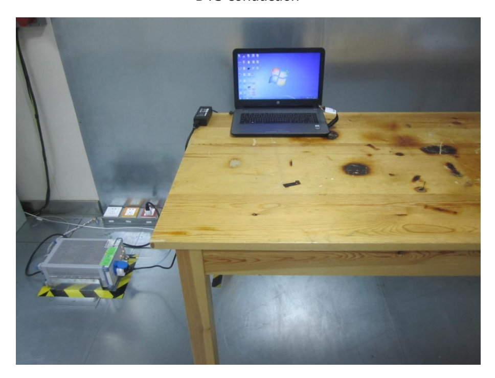
DTS radiation L