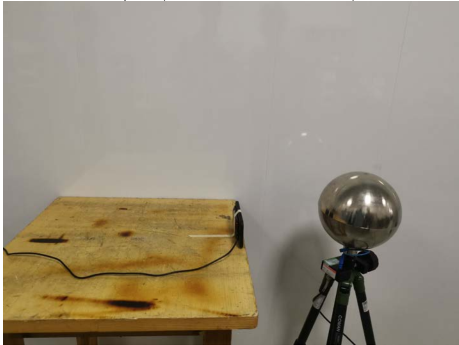
Bottom Side(measurement distance of 15cm)