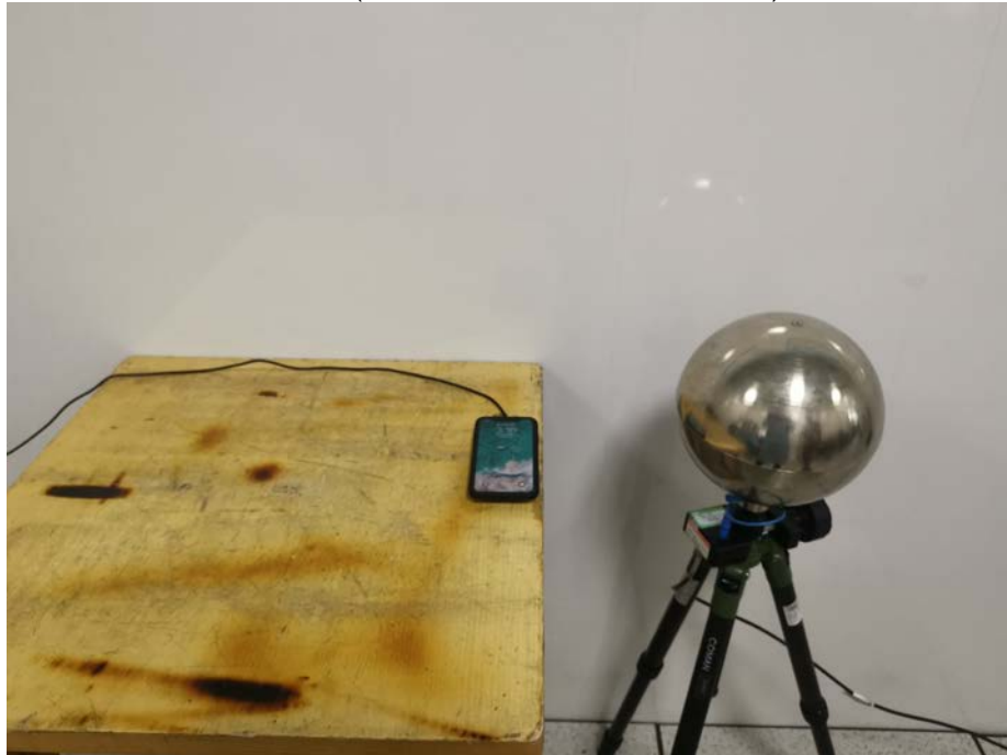
Right Side(measurement distance of 15cm)