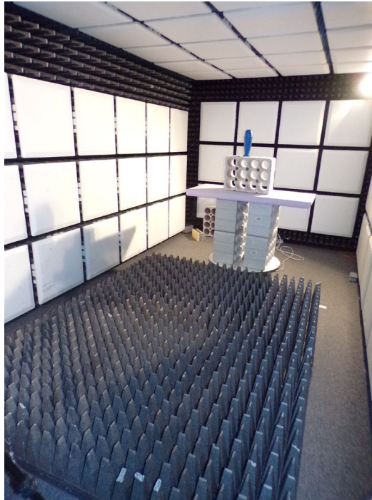
Radiated emissions 1GHz-25GHz (Equipment 150cm above floor in FAC)

Note: Three orthogonal axis measurements on EUT are performed to obtain the maximum peak field strength, with a 60° rotation on each axis. (Clause 6.6.5 of ANSI C63.10).