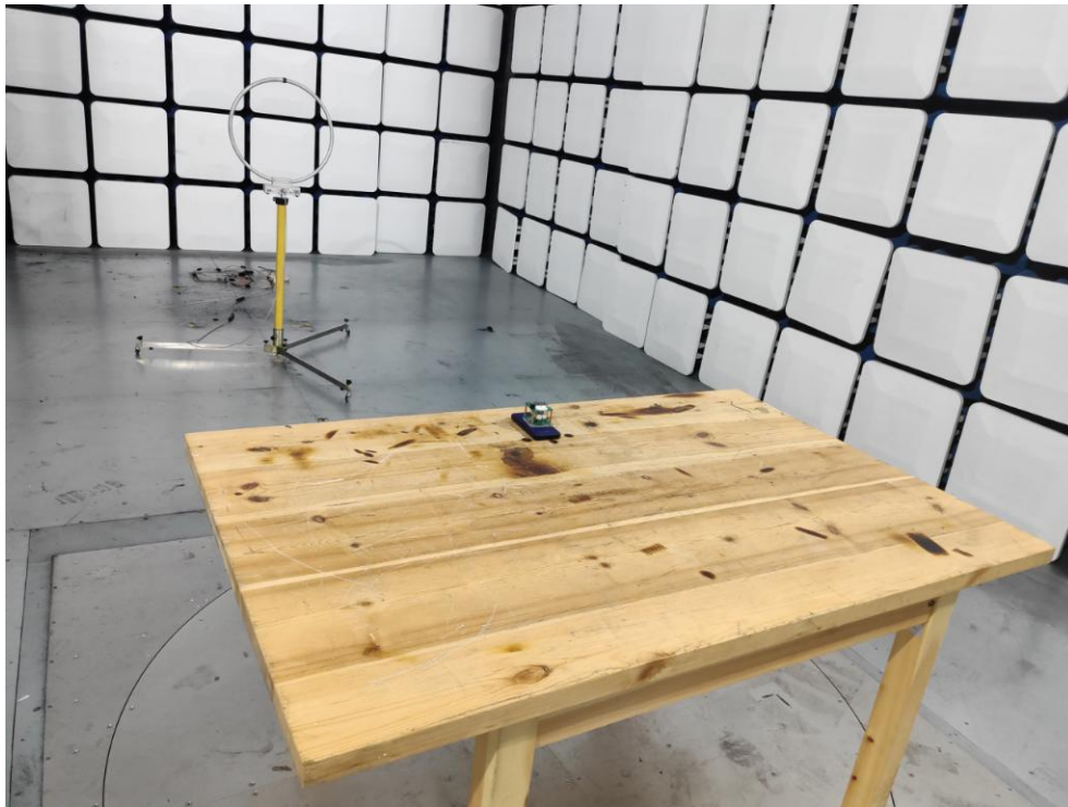
Photo of MPE Measurement